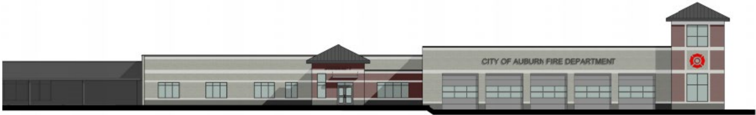
Front Elevation- Seminary Street