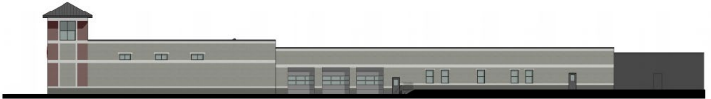
Side Elevation- Nelson Street