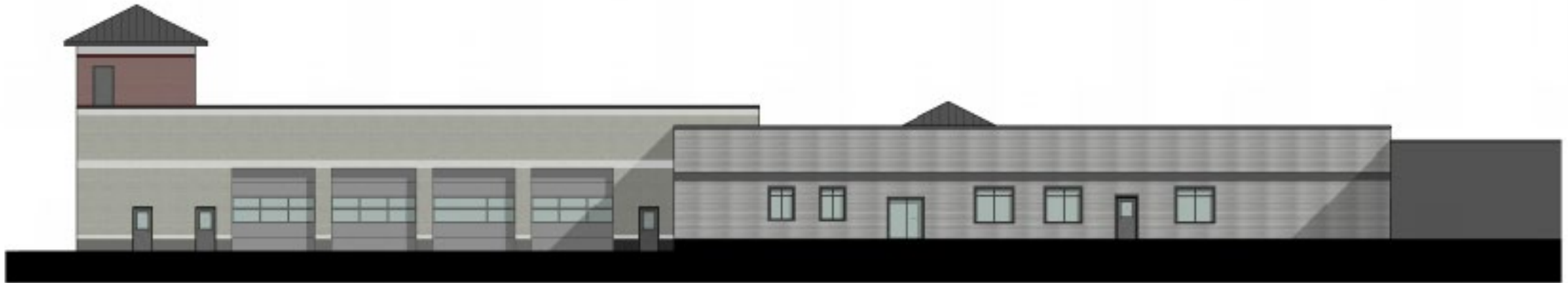
Back Elevation- Willard Chapel