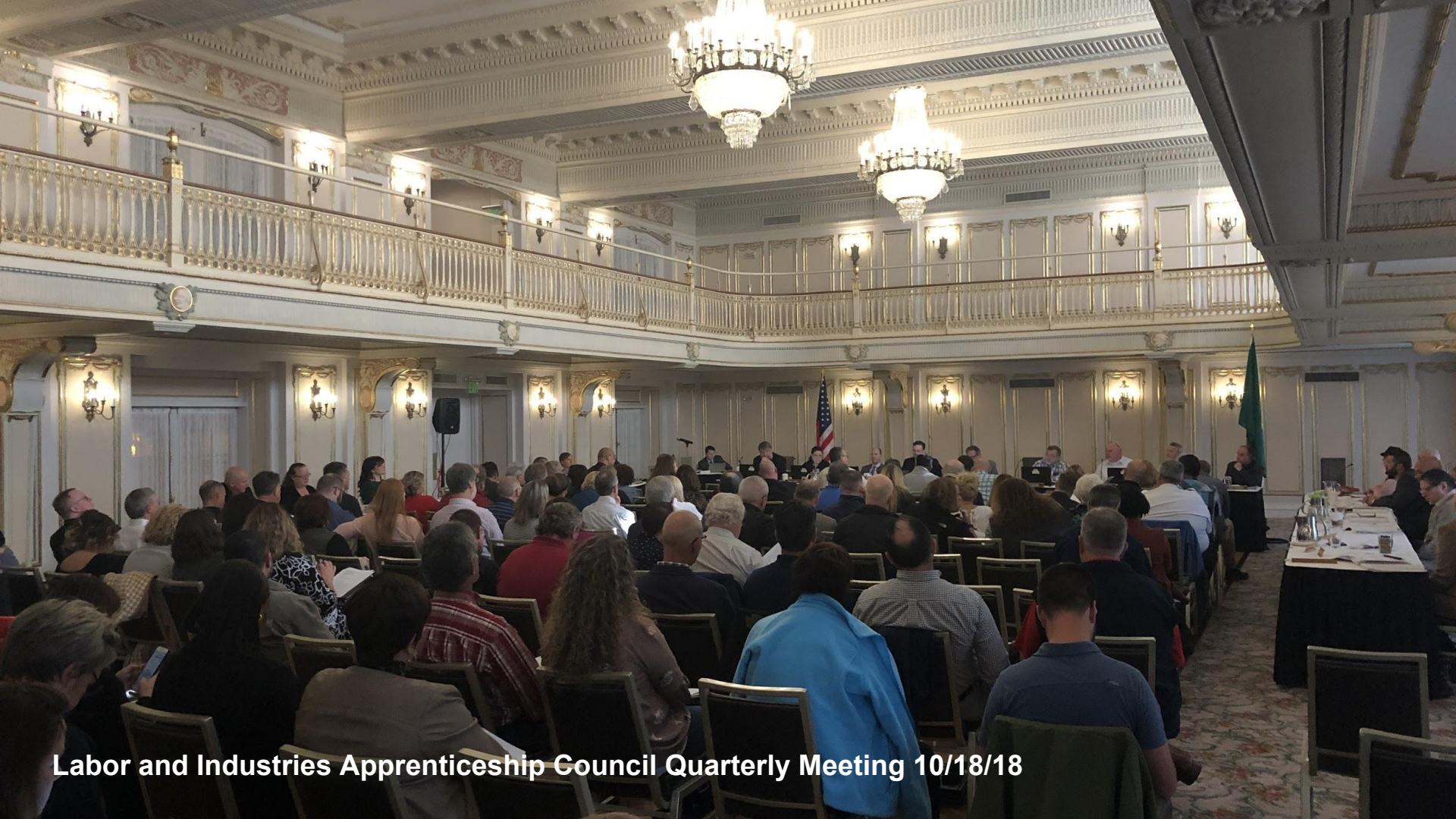
Labor and Industries Apprenticeship Council Quarterly Meeting 10/18/18